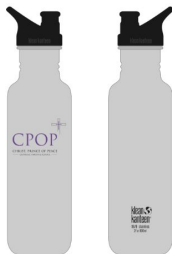
Klean Kanteen Stainless Steel water bottle 27 oz.: $18