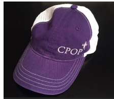
Trucker Hat: $20