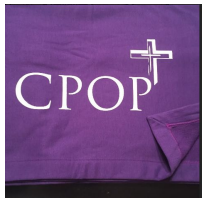
Purple Cotton/Fleece Blanket: $25