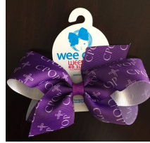
Wee Ones Bow: Purple $8