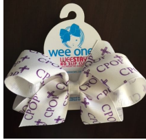
Wee Ones Bow: White--$8

We will deliver your items to your student at school (Please circle the items you want and write quantity if more than one)