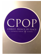
Car Magnet: $5